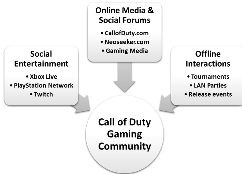
Figure 4.1 Forms of Online/Offline Interaction in the CoD Community

The Call of Duty online gaming community provides an ideal context in which to generate novel insight on the contested consumption practices as well as the processes and consequences of legitimation in consumption communities. Given the high degree of consumer interaction and the level of autonomy with which they act, the emergence of new practices and debates over their legitimacy among consumers in the field are a consistent feature of this context. The case of the modified controller in Call of Duty